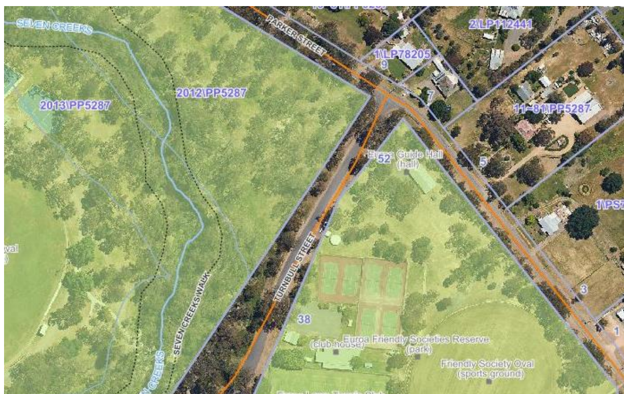
Guide Hall, near Friendlies and Creek.