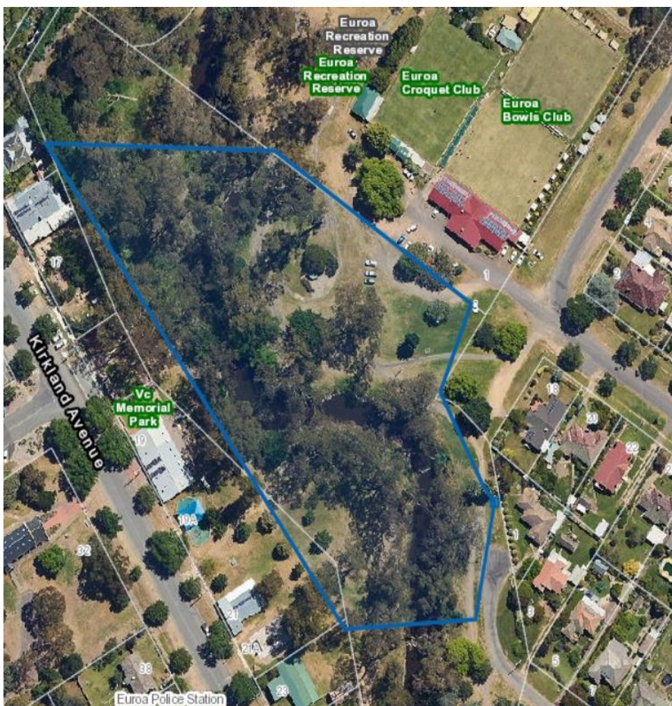
Creek Location at the end of Foy Street