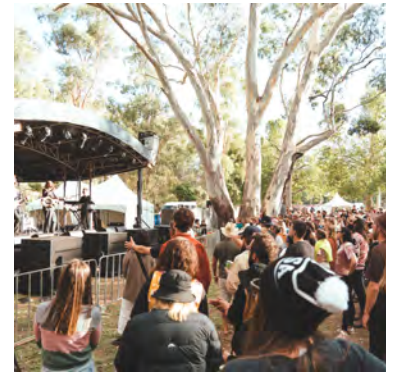
FOOD & CELEBRATION